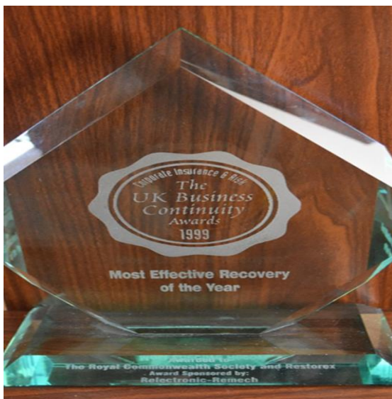
Disaster Recovery of the Year awards 1999 and 2001