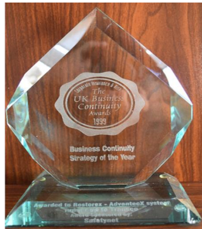
Business Continuity Strategy