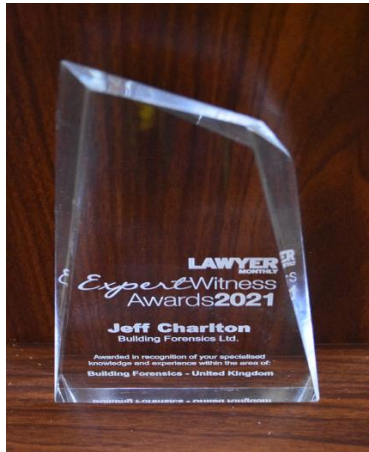
Expert of the Year