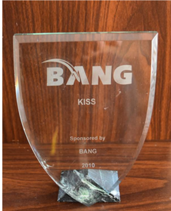
Innovative product CBRN Response Planning